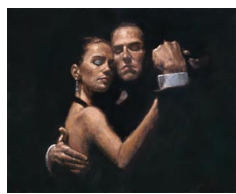
Face of Tango II

a meal, a dance and nothing but the empty cover of an eyebrow pencil at the bottom of my purse.