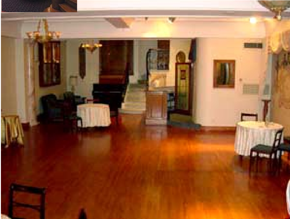
The “Carlos Gavito Salon” at the Dandi Royal Mansion in Buenos Aires

A ROUND THE WORLD special events have been taking place to honor the late Carlos Gavito. Many milongas have been dedicated to his memory and many glasses have been raised to toast the man that exemplified tango fo so many people.