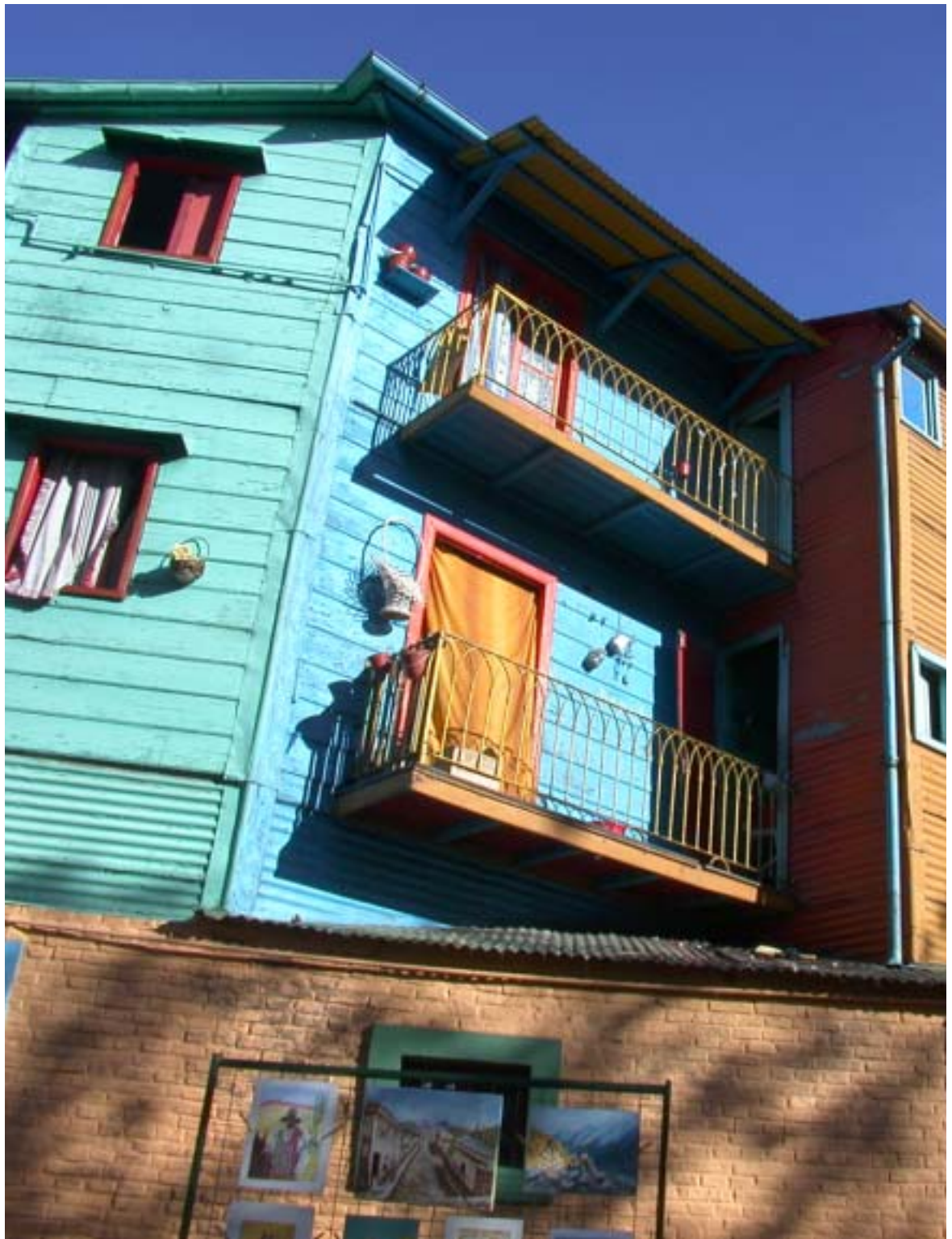
Color on Caminito in La Boca, Buenos Aires, Argentina • Photo courtesy of Sarah Graff

JULY 2004, VOLUME 05, ISSUE 06 www.tangonoticas.com