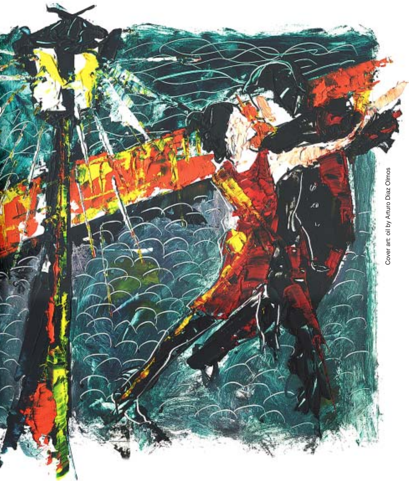
Cover art: oil by Arturo Diaz Olmos

JANUARY 2004, VOLUME 05, ISSUE 01 www.tangonoticas.com