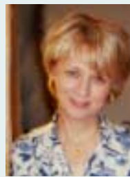
Layout & Design: Connie Orbeta corbeta@.elgin.cc.il.us