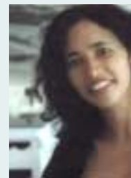
Illustrator & Cover art: Yanira